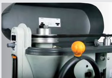
Fig.: B 160 T Vario

· Better power transmission due to the quality toothed V-belt · Very smooth running due to aluminum pulleys