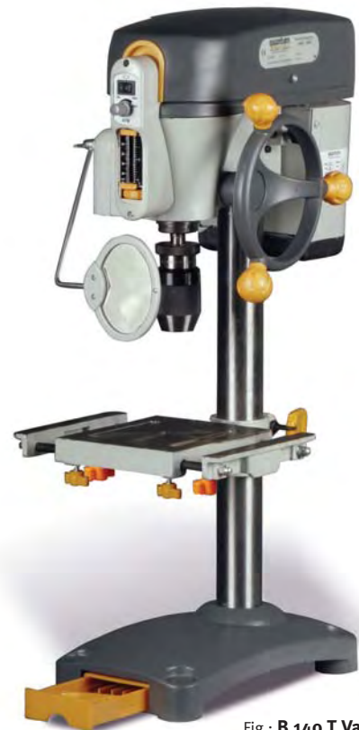
Fig.: B 140 T Vario